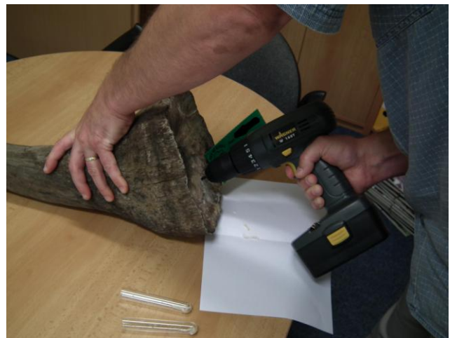
Sampling of horns for DNA analysis