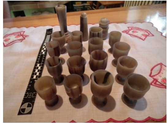
Cups from buffalo horns presented as rhino