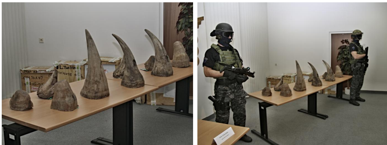
Photos from the press conference after realization of Operatin RHINO