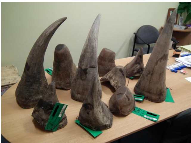
10 rhino horns seized at the Prague airport

Czech Environmental Inspectorate took samples from seized rhino horns and sent them to University of Pretoria (RHODIS database) and SASA Wildlife Forensic Unit in Great Britain for DNA analysis.